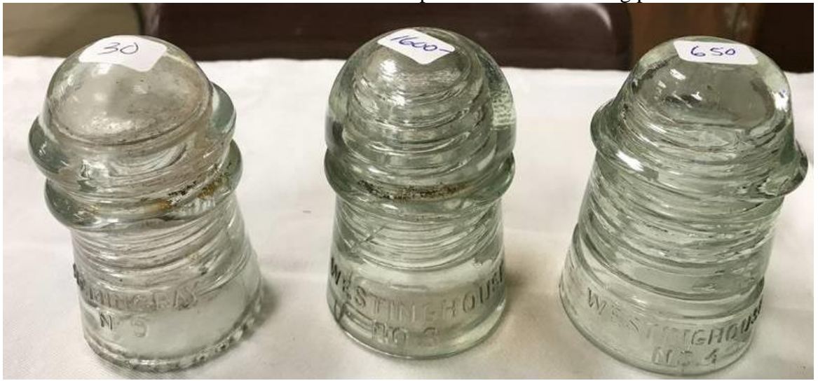
Hemingray and Westinghouse insulators on Steve's table

There were quite a few collectors at the show but I don't recall any who walked in with insulators to sell. In previous years, some dealers who made last-minute decisions to come sold out of their car or area residents would show up with a few interesting pieces.